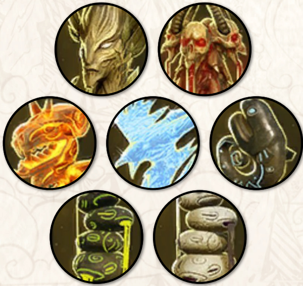
(35) Totem Tokens 5 Each (A-E) of Wood, Blood, Fire, Water, Lightning, Poison, and Oil Totems