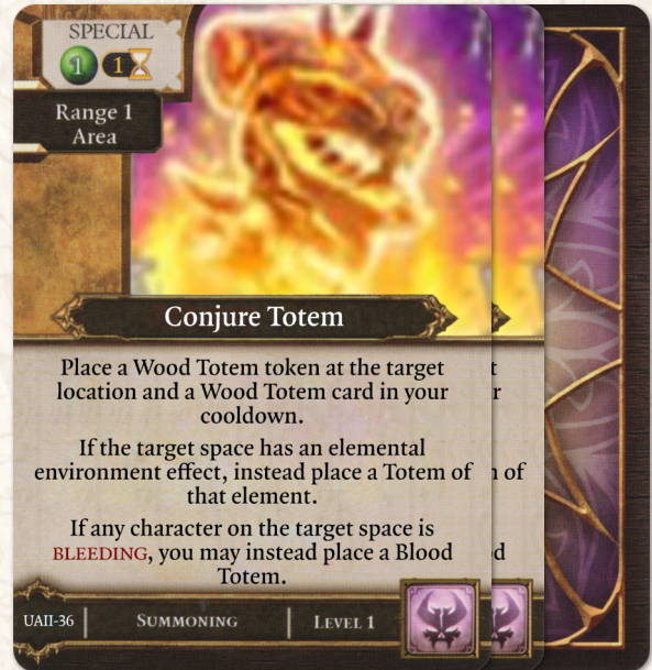
(2) Summon Totem Cards